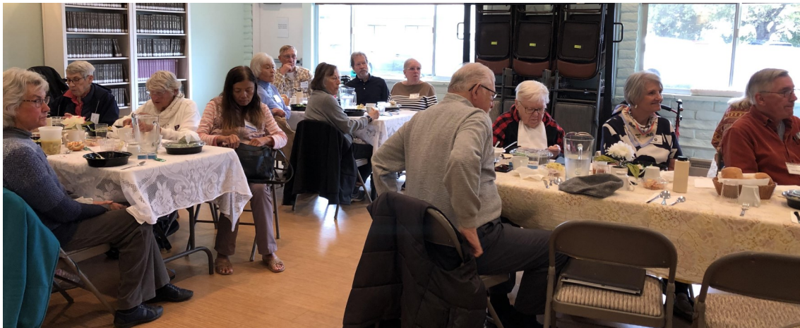
RPEA Chapter 9 members enjoying a catered lunch from Castelli's Deli.

More information inside on what to do if you get scammed.