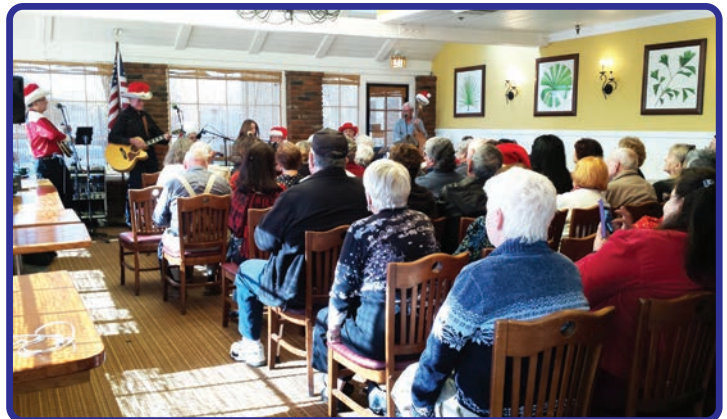
Chapter 014 – VENTURA/SANTA BARBARA holiday celebration. 55 Members and 2 guests attended this great holiday celebration where the All Country Grass Band performed.