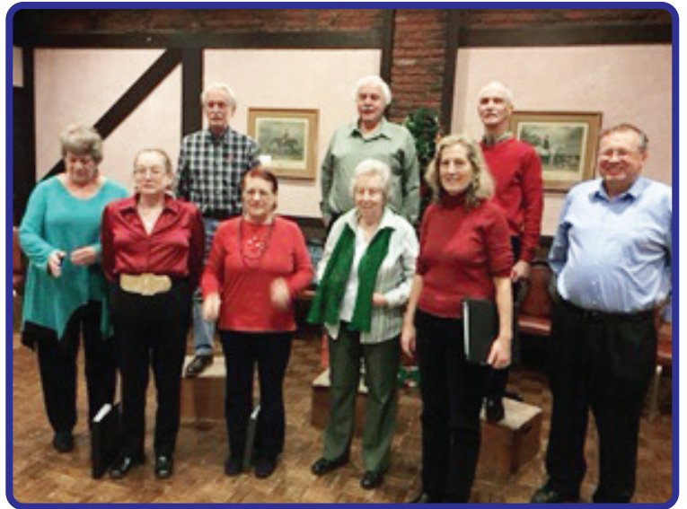
The Serendipity Singers performing at the Chapter 009 – SURF CITY SANTA CRUZ holiday party.