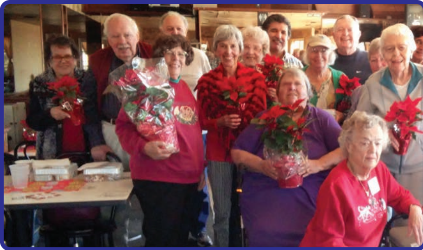
Chapter 064 – NEWPORT BEACH December 12 holiday party