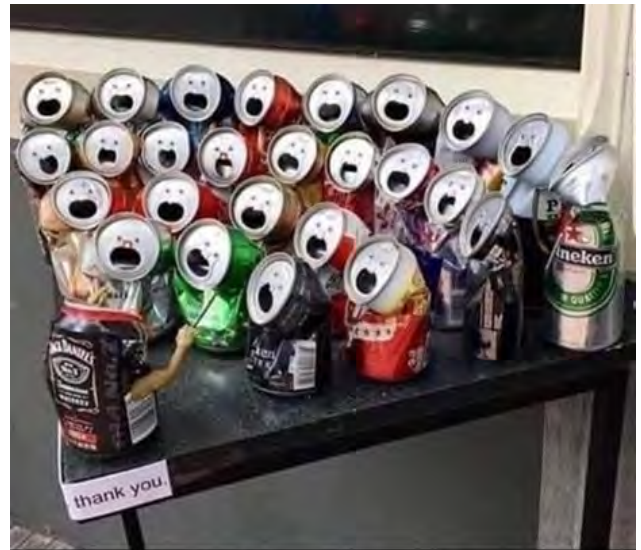
They sing because they can.