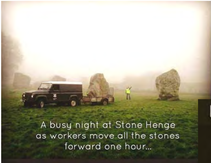
A busy night at Stone Henge as workers move all the stones forward one hour...

Friends please put on a mask. It saves lives. Yesterday a friend of mine went out with his girlfriend and on the way passed by his wife and she did not recognize him. The mask really saved his life