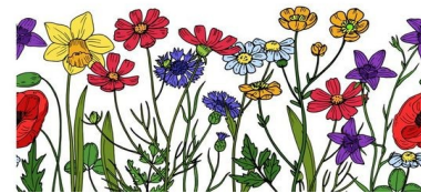
Auburn InterFaith Food Closet

On the left is the RPEA Chapter 030 brick we ordered to be placed with others, at the new Food Closet in Auburn. Looks pretty sharp!