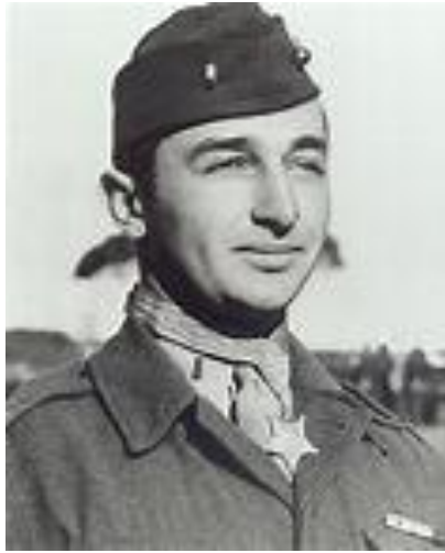
Colonel Mitchell Paige, U.S. Marine and WWII Recipient of the Medal of Honor